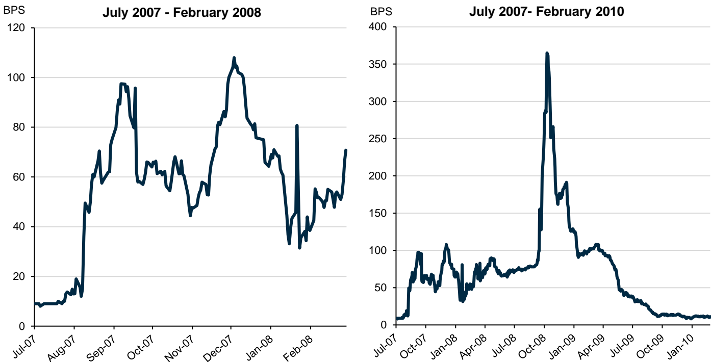
FIGURE 1: LIBOR-OIS SPREAD 3-MONTH 6

For illustrative purposes only.